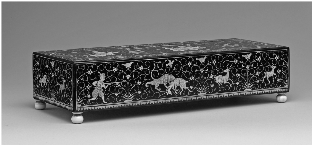
© Cynthia Hazen Polsky and Leon B. Polsky Fund, 2000

Source: Inlaid box made in Gujarat, India, for export to Portugal, circa 1600. Teak, ebony, and other precious hardwoods, with ivory details.